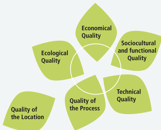
DGNB Certificate: the six areas of evaluation

As a clear and easily comprehensible rating system, the certificate covers all relevant fields of sustainable building and distinguishes outstanding buildings in gold, silver and bronze. Six areas of evaluation are singled out in the assessment: ecology, economy, socio-cultural and functional aspects, techniques, processes and location. The location is reported separately.